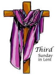
Third Sunday in Lent