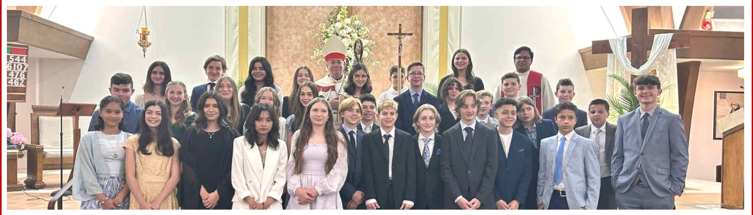
SAINT DOMINIC SCHOOL