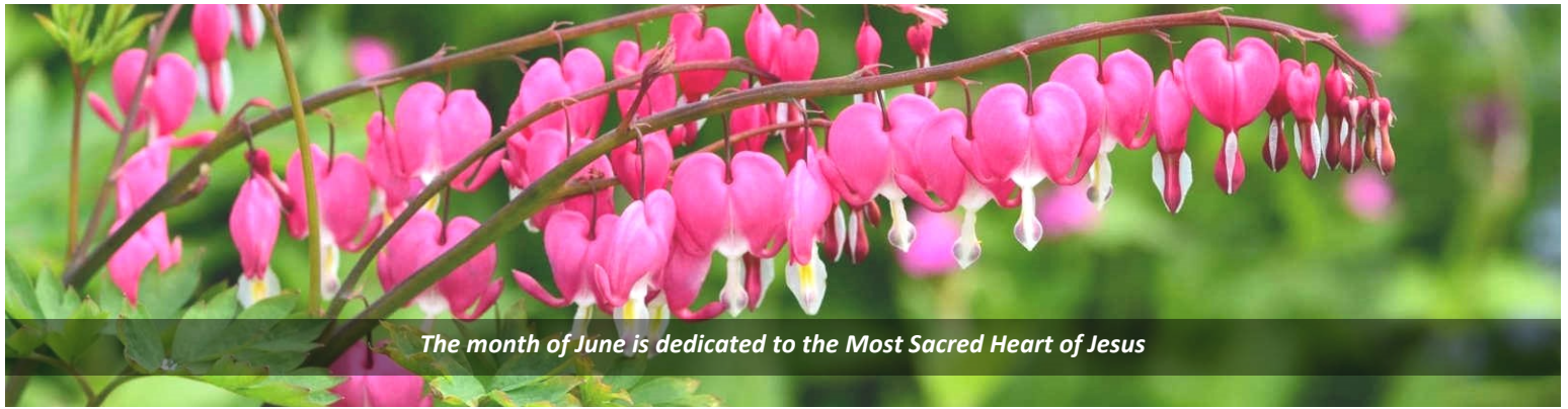
The month of June is dedicated to the Most Sacred Heart of Jesus