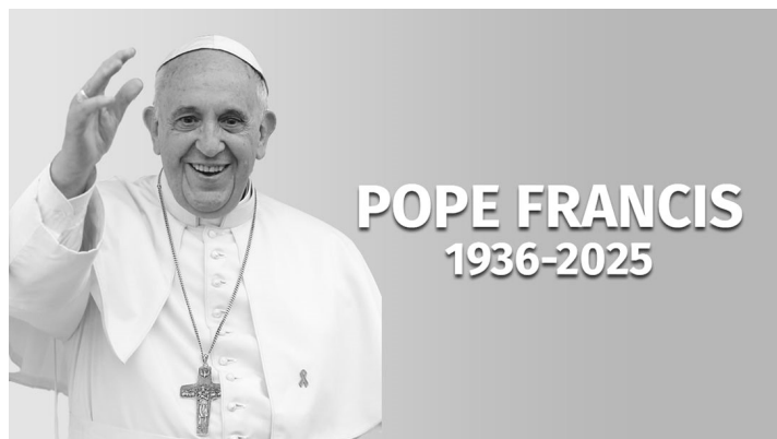
POPE FRANCIS 1936-2025

We pray for the repose of the souls of our dearly departed, especially, Pope Francis , who passed away on Easter Monday, April 20, 2025. May they all, through the mercy of God, rest in peace. Amen.